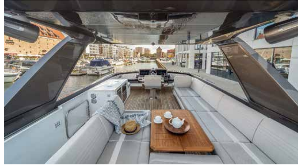
A dining settee on the flying bridge is an excellent spot to tuck into an alfresco meal.

T he 700 SKY is a perfect evolution for Galeon utilizing lightweight carbon fiber technologies and powerful engines to deliver stunning performance. Her design delivers more game changing features with an expandable bow and a few other surprises. Aboard you will find a light and welcoming salon with a luxurious finish while the expansive flybridge awaits your next party or family gathering.