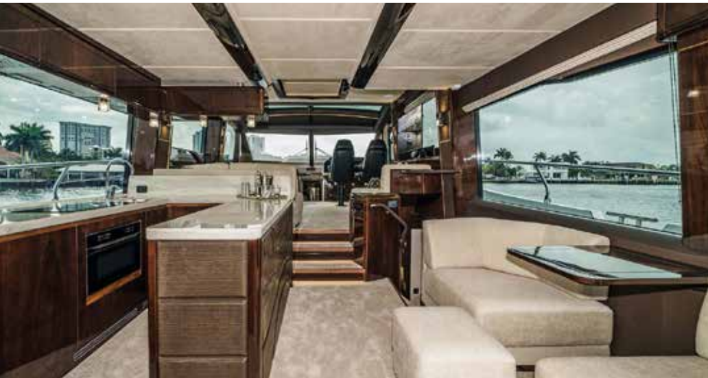
A centerline passageway through the salon makes for safe and easy transit even in a seaway.