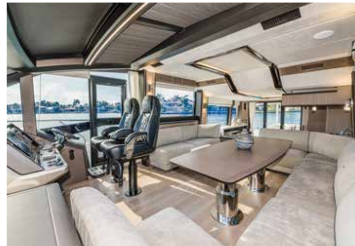
Twin helm chairs and plush, U-shaped seating around a forward dining settee are hallmarks of the luxury you'll find aboard this yacht.

Note: Layout and features may vary from shown here due to manufacturer consideration and client customization.