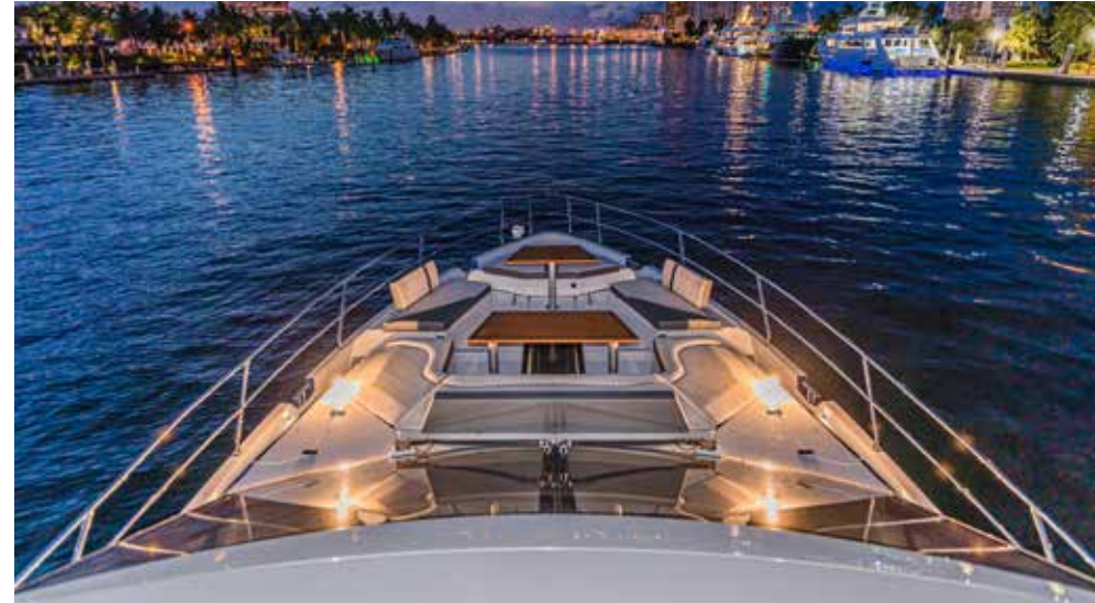
An enormous foredeck lounge features multiple settees and sunpads to help keep the party going.