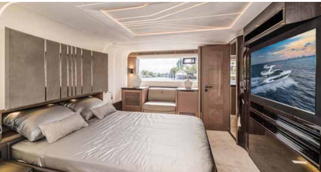
Massive hullside windows keep the 680 FLY's master stateroom bathed in lustrous natural light.