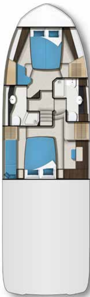
2 CABIN OPTION