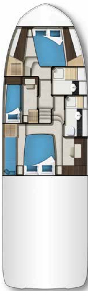
3 CABIN STANDARD