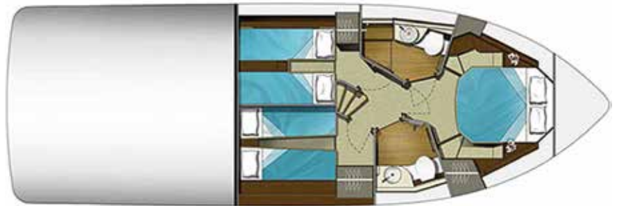
BELOW DECK - 3 Cabin, 2 Head