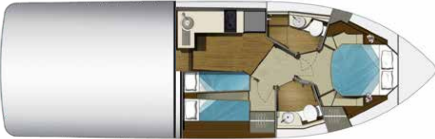
BELOW DECK - 2 Cabin, 2 Head