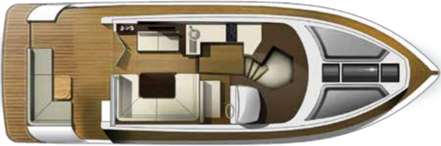
COCKPIT/MAIN DECK - 2 Cabin, 2 Head