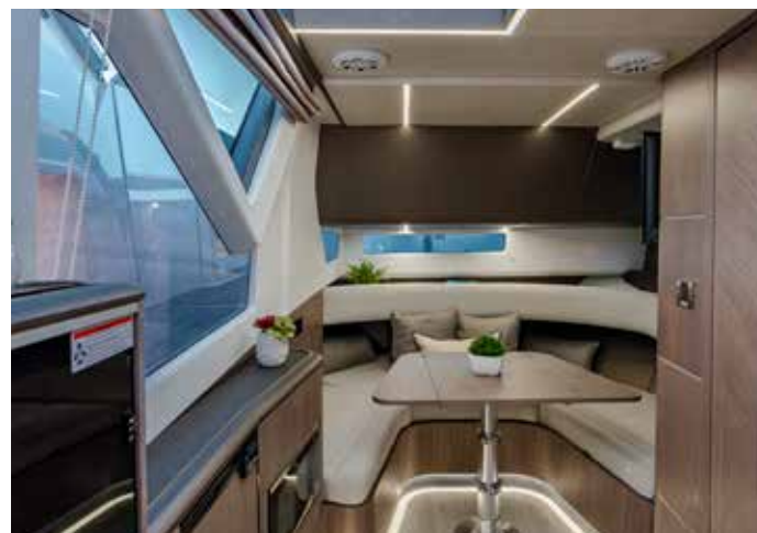
Below deck impresses with yacht quality finishes and sleeps 4, making this an enviable choice for an overnight excursion.