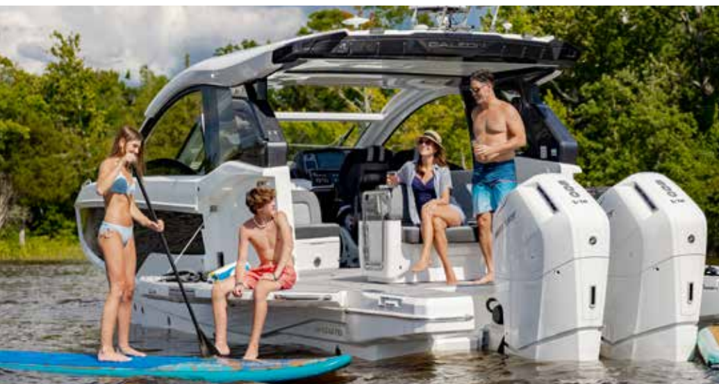
The 375 GTO has Galeon DNA in spades, and it's particularly on display when her trademark "Beach Mode" is activated.

A dayboat like no other, the Galeon 375 GTO is aptly named – Grand Touring Outboard. Offering unparalleled excitement, both the boat's helm and profile take inspiration from the auto-racing world making this model nothing short of a pleasure to drive.