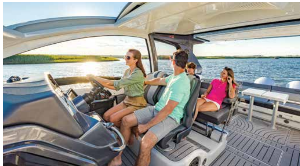
An enclosed, spacious helm offers protection from the elements with an outdoor area protected by an electric awning.