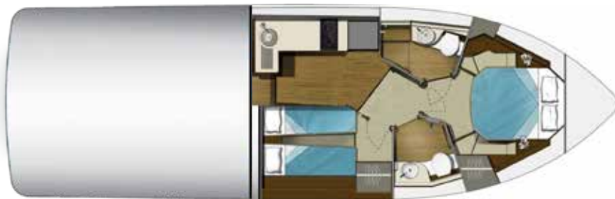
BELOW DECK - 2 Cabin, 2 Head