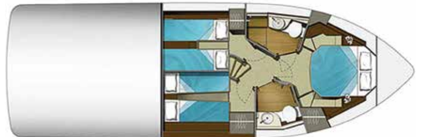
BELOW DECK - 3 Cabin, 2 Head

The right is reserved to make changes, without notice, at any time, in equipment, materials, and specifications. Drawings, photos, and renderings may show optional equipment.