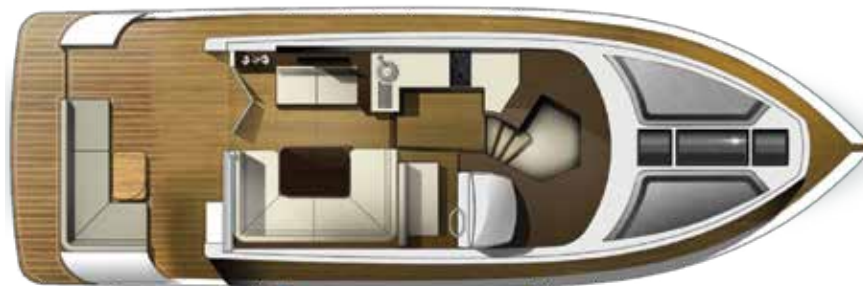
COCKPIT/MAIN DECK - 2 Cabin, 2 Head