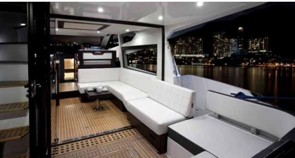
The yacht's layout includes a step-less entryway from the cockpit into the salon, which helps seamlessly meld the two areas.