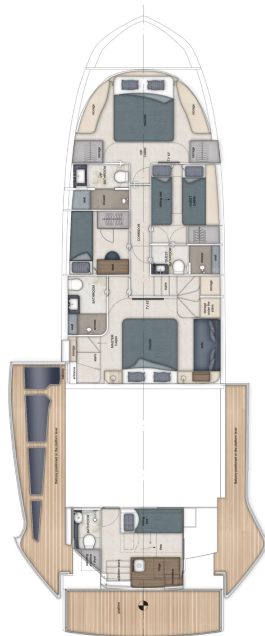
LOWER DECK - OPTION 2

The right is reserved to make changes, without notice, at any time, in equipment, materials, and specifications. Drawings, photos, and renderings may show optional equipment.