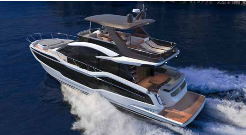
Loads of glazing along the hull sides combine with massive windows on the main deck to create an airy and futuristic look.