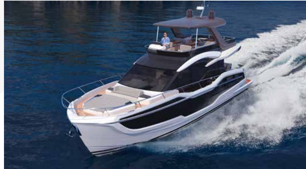
An expansive sunpad makes for an intimate setting for catching some rays, while also acting as another alfresco entertainment space.

T he 560 FLY first grabs the eye with lines that are both muscular and playful. A wide beam that carries well forward gives this vessel a substantial presence. It's a design choice that pulls double duty, allowing for unmatched interior volume, particularly on the accommodations level. But the 560 FLY has other attractive exterior aesthetics at play as well. This is a yacht with lines to remember.