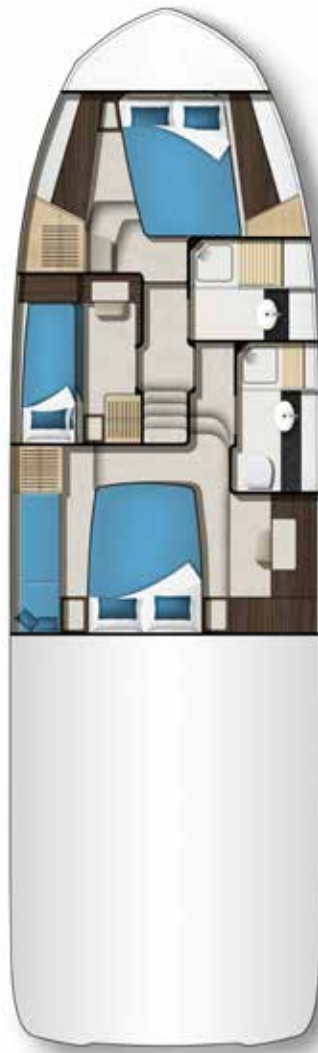
3 CABIN STANDARD