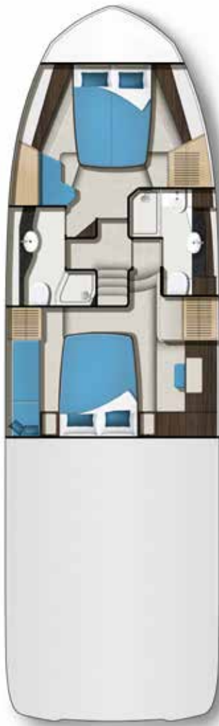
2 CABIN OPTION