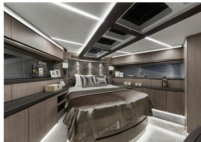
The level of fit and finish on the 640's accommodations level is unparalleled, and the stowage spaces are both plentiful and creative.