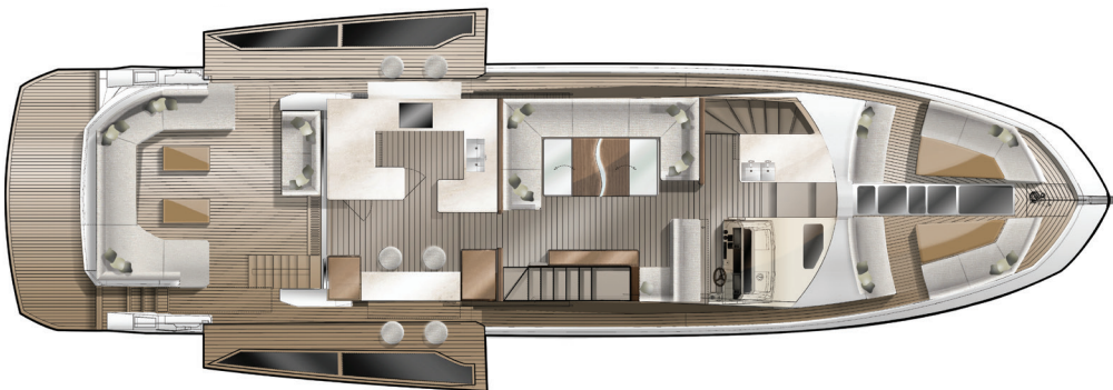
MAIN DECK OPEN