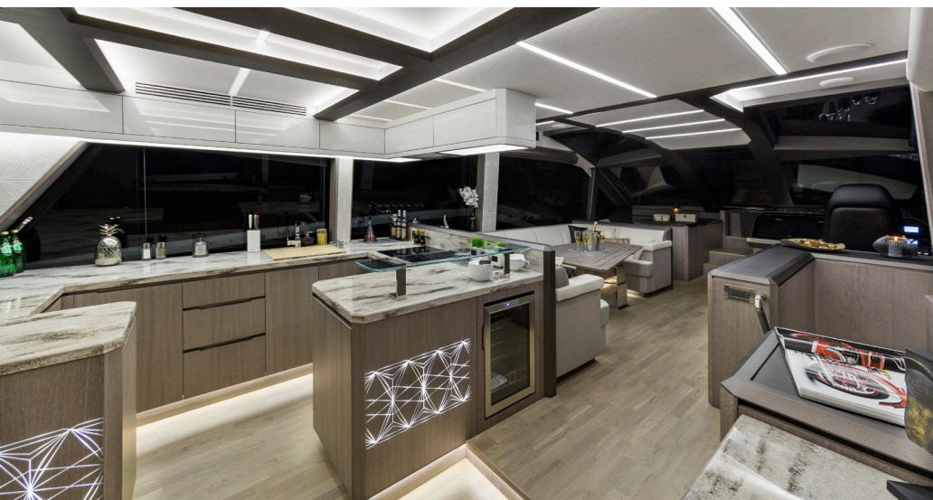
The aft galley on the main deck has an exceptional amount of counter space and stowage, both of which should please the chef.

T he Galeon 640 FLY transcends mere form and function with stunning contemporary design and expertly hand-crafted interiors. This transformer yacht is revolutionizing the segment with its innovative approach to layout. With powerful Volvo propulsion systems and advanced electronics and controls, the Galeon 640 FLY will deliver experiences that create lifelong memories of times spent with friends and family. All with a style that will make its owner the envy of any port-of-call.