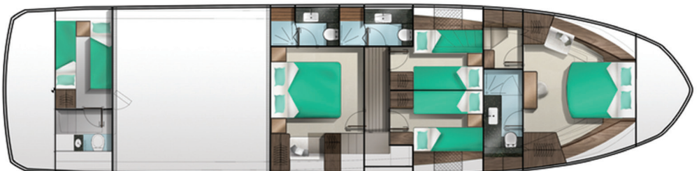
LOWER DECK FOUR CABIN

The right is reserved to make changes, without notice, at any time, in equipment, materials, and specifications. Drawings, photos, and renderings may show optional equipment.