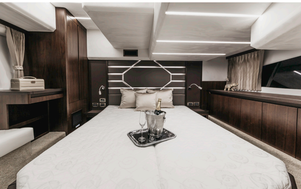
The 425's full-beam, amidships, master stateroom with an en suite head offers excellent privacy and keeps the owner well rested and refreshed

T he 425 HTS is a smaller sibling to the Galeon 485 HTS. We have re-invigorated the ever popular express style yacht by eliminating the need for soft curtains while still providing a truly open yacht. Close it up and enjoy the climate controlled cockpit or open the roof, doors, and windows and you can laugh about the old days of fighting canvas to stay dry from the approaching rain shower.