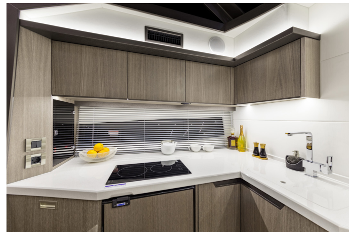
Meals are prepared in a fully equipped galley down below that offers the chef peace and quiet while cooking