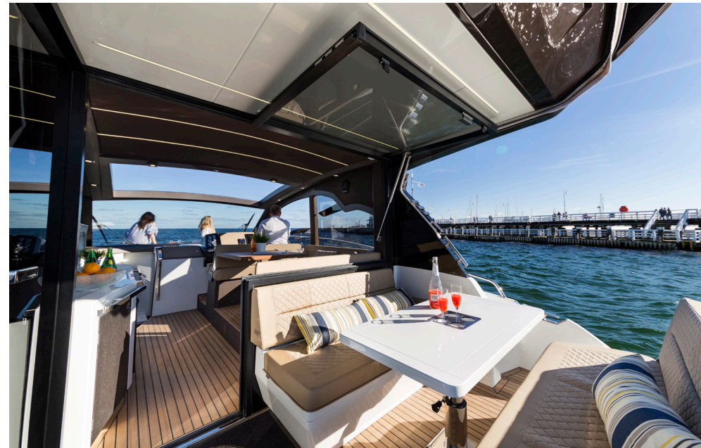
An alfresco dining settee in the cockpit that lets guests enjoy fresh sea breezes while taking their meals