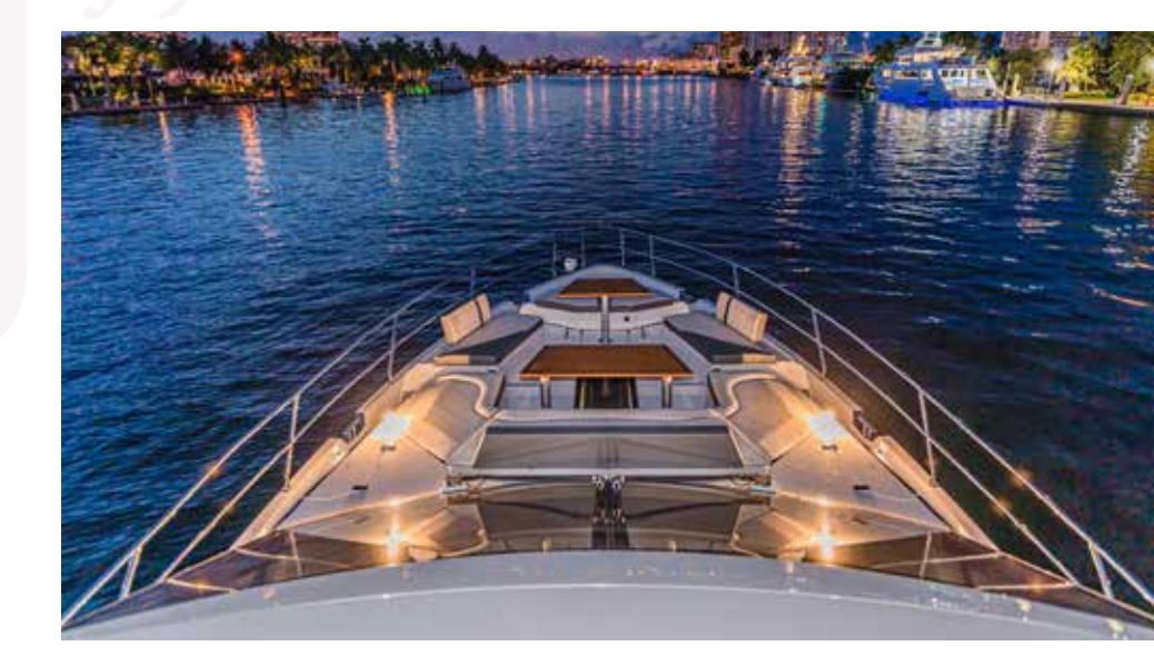
An enormous foredeck lounge features multiple settees and sunpads to help keep the party going.