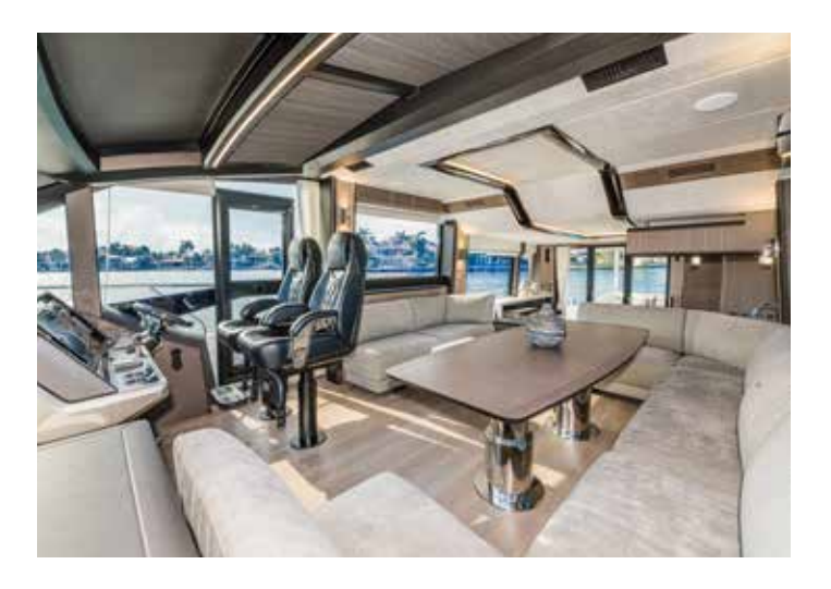
Twin helm chairs and plush, U-shaped seating around a forward dining settee are hallmarks of the luxury you'll find aboard this yacht.

Note: Layout and features may vary from shown here due to manufacturer consideration and client customization.