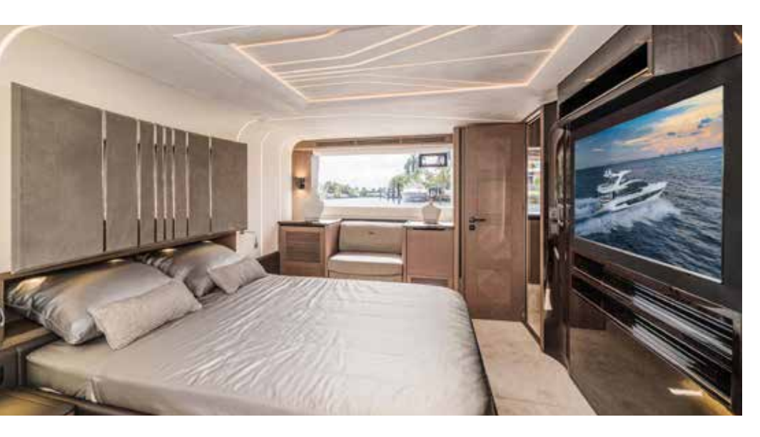
Massive hullside windows keep the 680 FLY's master stateroom bathed in lustrous natural light.

he 680 FLY is a perfect evolution utilizing lightweight carbon fiber technologies and powerful engines to deliver stunning performance. Her design delivers more game changing features with an expandable bow and a few other surprises. Aboard you will find a light and welcoming salon with luxurious finishes while the expansive flybridge awaits your next party or family gathering.