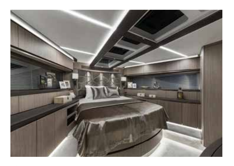
The accommodations level on the 650 competes with much larger yachts in terms of spaciousness and luxurious appointments.