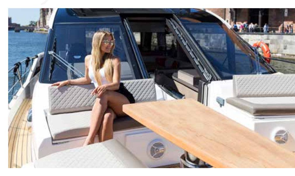
Galeon is known for its innovations, such as this window that offers inventive access to the foredeck lounge.