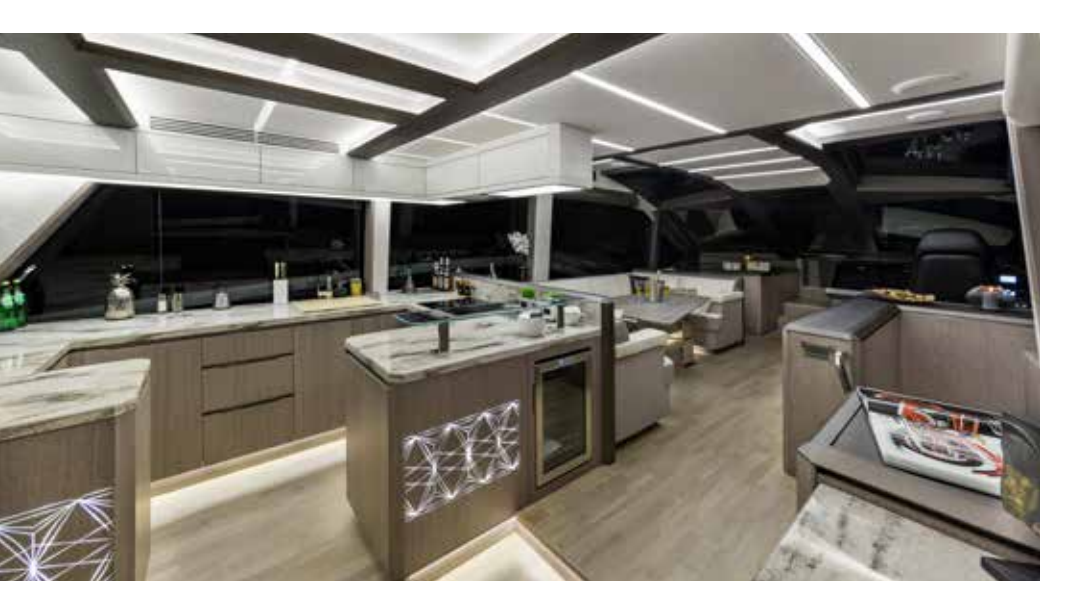
The main-deck layout is such that the galley, dining settee, and helm all have open lines of communication, making for a convivial environment.

The 650 SKY is the pinnacle of design and technical prowess. Be transcended and transformed as the 650 SKY leaves you breathless as her volume belies her physical dimensions and every turn offers a game changing innovation. The carbon fiber Skydeck roof panels eloquently disappear to reveal a large bridge while the available tender garage and rotating cockpit seat provide for endless vistas and truly unique experiences onboard. With the proportions of larger yachts designed carefully into an amazing package.