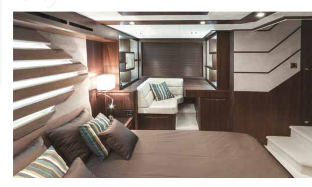
The master stateroom offers sumptuous space to enjoy private time in ultimate comfort. Enjoy morning coffee with a view on the en-suite settee.