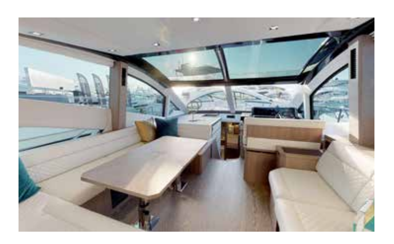
Powerful and graceful, the Galeon 560 SKY performs with solid poise that creates a spirit of confidence and assurance from either helm. Bring the outdoors inside with the opening sunroof and windows.

Note: Layout and features may vary from shown here due to manufacturer consideration and client customization.