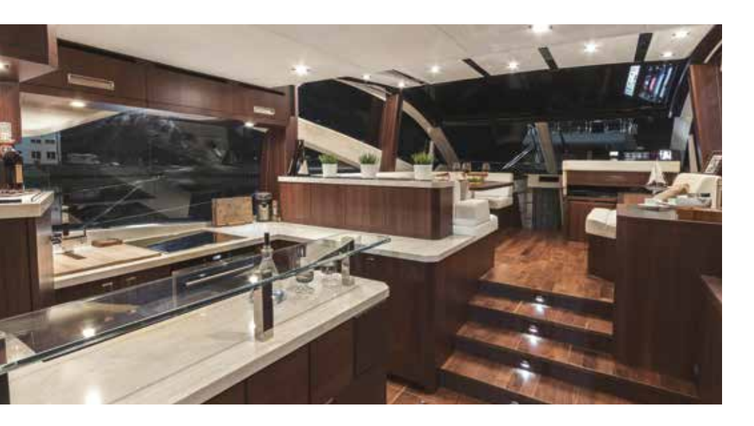
Scenic views abound through large sweeping windows throughout the salon, forward helm and gourmet galley.

he Galeon 560 SKY is a magnificent example of Old-World craftsmanship coming together with innovative design and today's technologies. Every detail is forged to impress even the most demanding aficionado. Warm, rich woods, large, sweeping windows and supple materials combine to form impeccable accommodations to spend special times with family and friends or to entertain business associates in grand style.