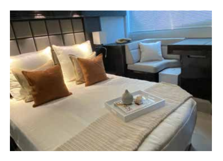
The master suite is a highlight onboard this yacht, and will impress with its ample space and cozy nooks.