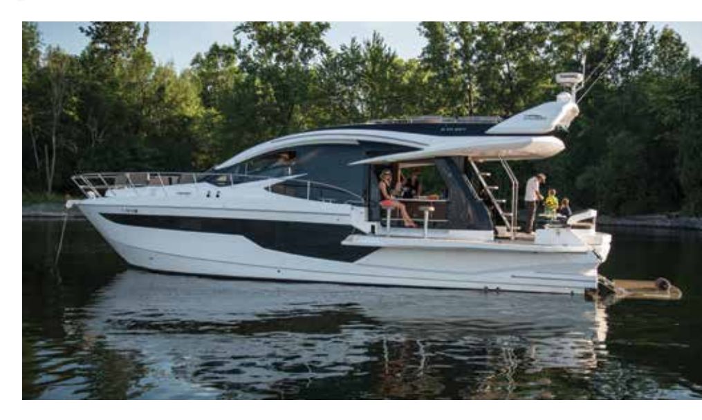
In "Beach Mode" fold-out terraces create a massive outdoor entertaining area in the after section of the boat.