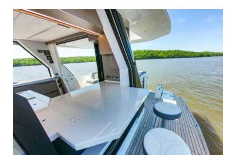
The fold-out terraces make an excellent location for an alfresco bar set-up.

Note: Layout and features may vary from shown here due to manufacturer consideration and client customization.