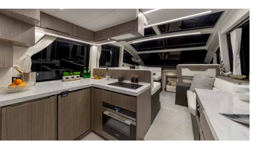
The salon is well-lit thanks to multiple overhead skylights, large windows to port and starboard, and a steeply raked windshield.

he 470 SKY joins the lineup bringing even more innovation to the Galeon Third Generation range. Based on the successful 460 FLY, it shares the same hull design and main deck layout allowing for great space for passengers and activities. With its sleek lines, one can easily mistake it for a hardtop model, and yet it offers a top deck neatly hidden away with a soft roof. Find a complete helm station with space for leisure on the sport flybridge.