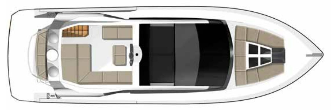
\textbf{COCKPIT/MAIN DECK} \quad \textit{Note: Cockpit seating different than shown for USA version. Galley to have cabinetry to starboard.}