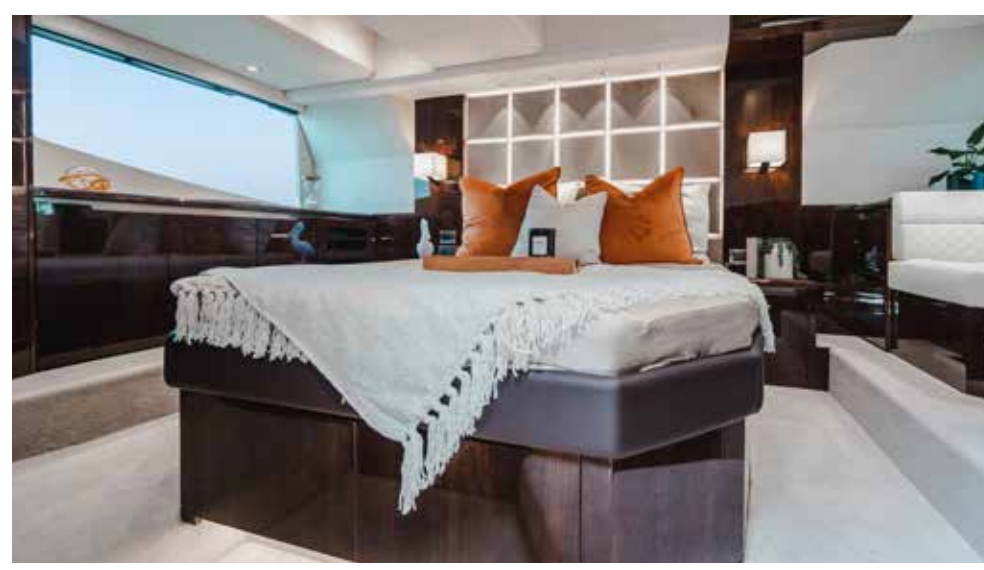
Note the enormity of the hullside windows, which help bathe the master stateroom in natural light.