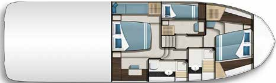
3 CABIN - STANDARD