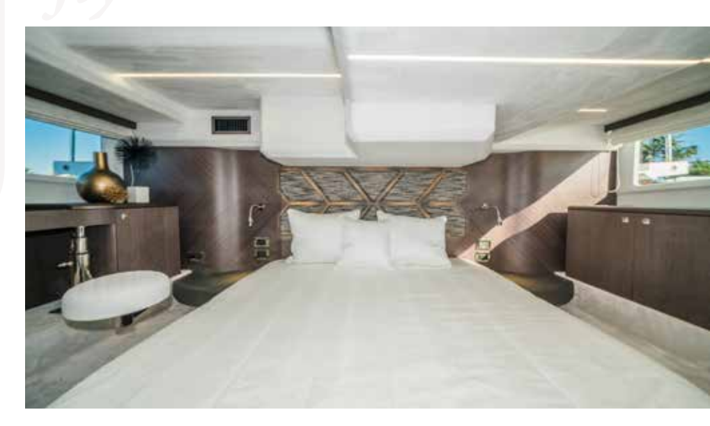
An amidships master with an island berth has large windows to either side, while scissoring berths in the forepeak VIP provide maximum privacy to guests.