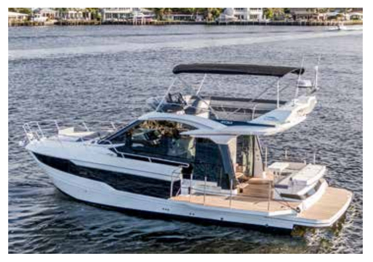
The yacht's "Beach Mode" feature employs fold-out terraces to either side of the cockpit to greatly amplify the available outdoor entertainment space.