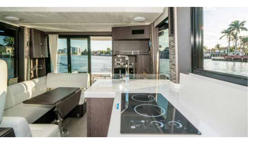
A main-deck galley, situated forward and to port in the salon, allows the chef to remain convivial with the guests while also enjoying the interior's plentiful natural light.

he Galeon 400 FLY has a contemporary presence that is as stunning as it is pleasing. The spacious flybridge is ideal for entertaining family and friends. The sheltered cockpit adds an additional al fresco social area that connects nicely with the salon's convertible seating. This model also offers "Beach Mode," extending the width of the cockpit deck. Underway, the 400 FLY makes a statement with its exemplary performance that is both powerful and agile.