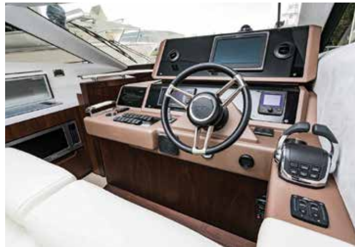
The upper helm is ideal when the weather is right. The lower helm is perfect for operating from the comfort of an air conditioned space with the added benefit of dual electric opening side windows.

Note: Layout and features may vary from shown here due to manufacturer consideration and client customization.