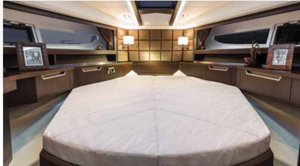
The master stateroom offers luxurious accommodations when it is time to turn in. Two guest staterooms provide privacy and comfort for family and guests.

T he Galeon 420 FLY has a sensational presence with stunning styling that is as contemporary as it is pleasing. The spacious flybridge is ideal for entertaining family and friends. The sheltered cockpit adds an additional al fresco social area that connects nicely with the saloon's convertible seating. Underway, the 420 FLY makes a statement with its exemplary performance that is both powerful and agile evoking confidence and pride of ownership.